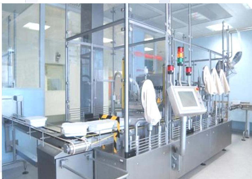
Figure 2: Syringe filling line BPM 4

The ready-to-use stoppers are transferred into class A by means of an alpha/beta port system. Unpacking the tub and detaching the lid is fully automated. The nested syringes are removed from the tub for filling. Immediately after the dosing process with rotary piston or peristaltic pumps, the plungers are inserted mechanically. The fill volume is monitored automatically in a non-destructive way by tare-gross weighing. Stopper position is checked and documented semi-automated with a camera.