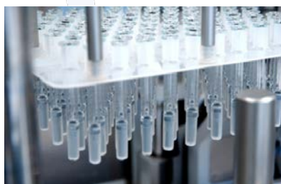
Figure 1: Syringes

In addition to manufacturing drug products in liquid and lyophilized vials, Boehringer Ingelheim can provide patient-friendly application forms like pre-filled syringes.